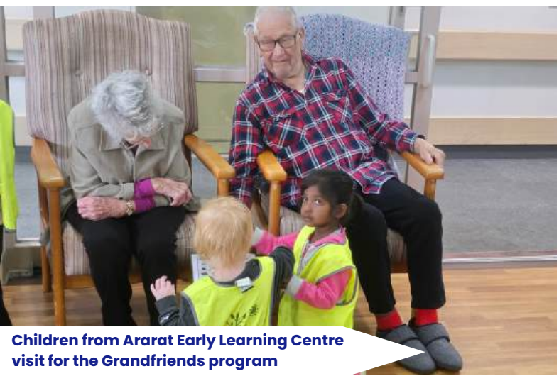
Children from Ararat Early Learning Centre visit for the Grandfriends program