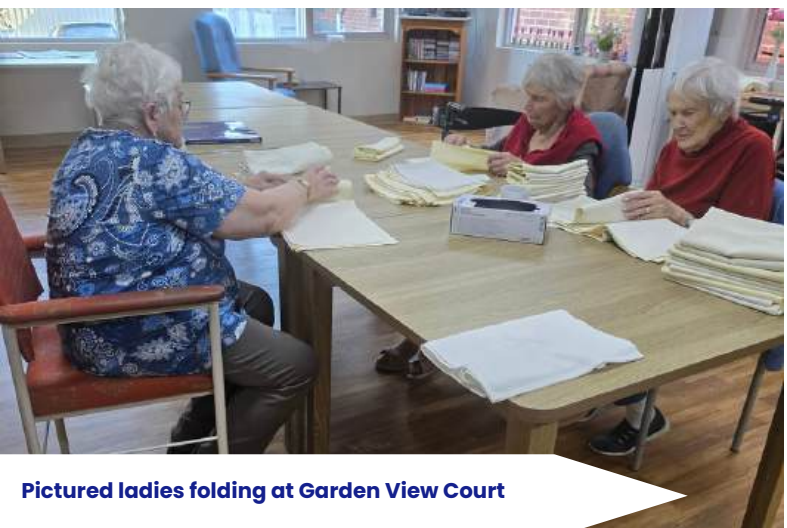
Pictured ladies folding at Garden View Court