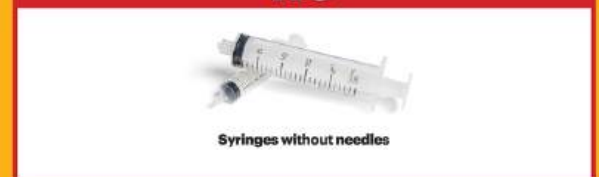
Syringes without needles