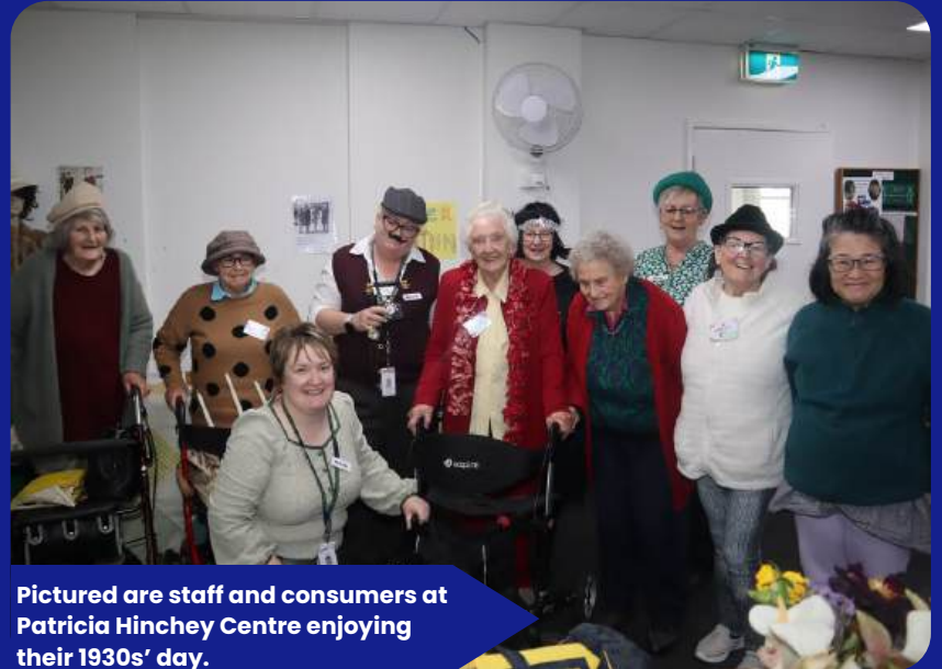
Pictured are staff and consumers at Patricia Hinchey Centre enjoying their 1930s' day.

Consumers also learned about 1930s' heroes such as champion racehorse Phar Lap, cricketer Don Bradman and also delved into the fashions of the era.