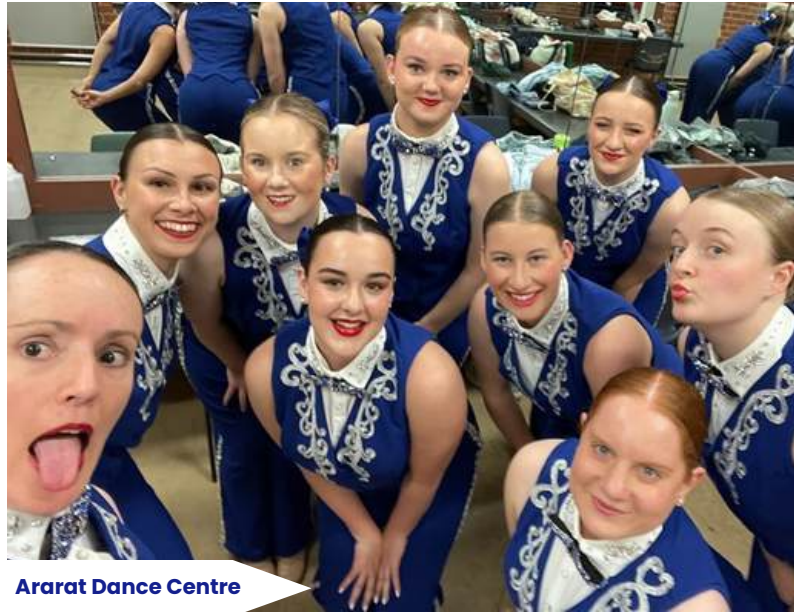
Ararat Dance Centre