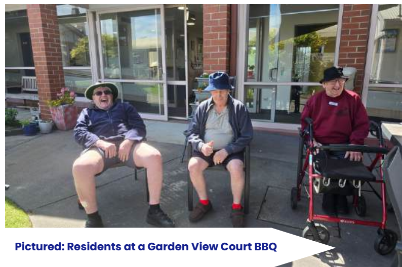
Pictured: Residents at a Garden View Court BBQ