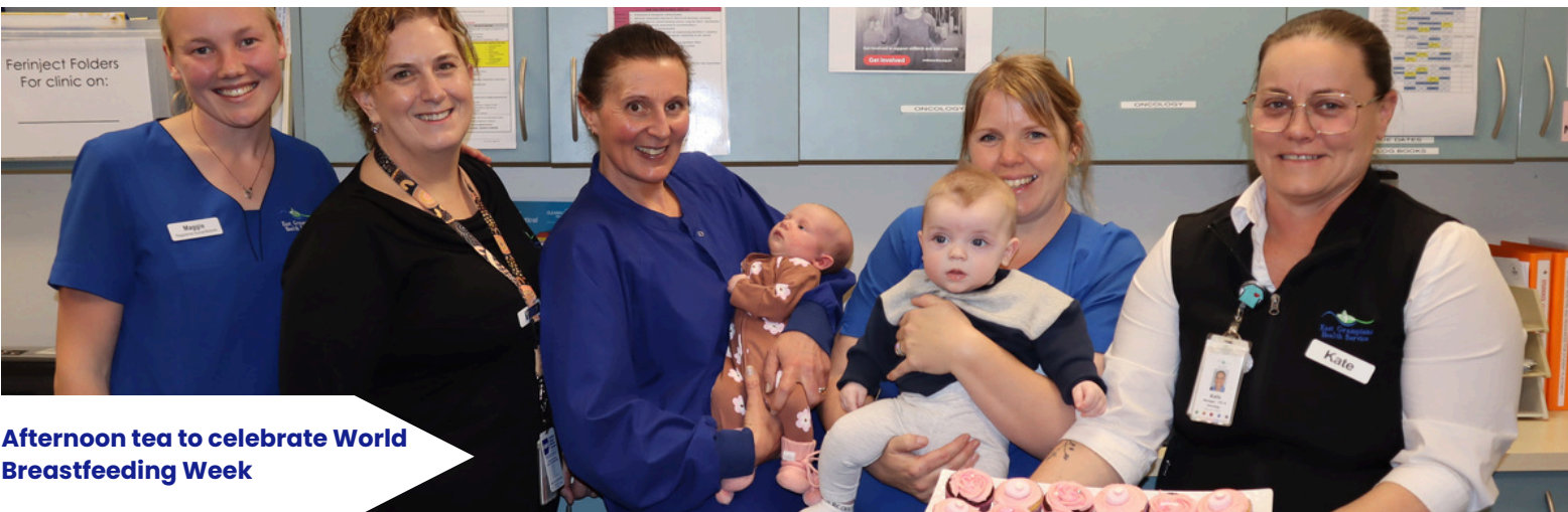
Afternoon tea to celebrate World Breastfeeding Week

An afternoon tea was held in the Inpatient Unit to celebrate World Breastfeeding Week.