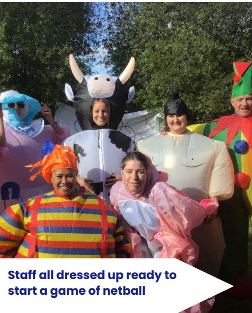
Staff all dressed up ready to start a game of netball