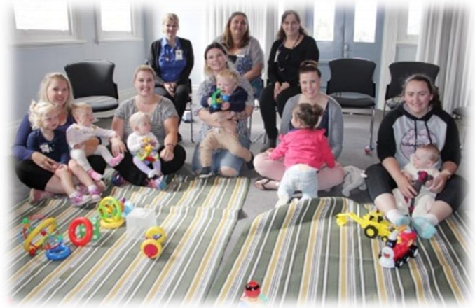
Pictured above are participants in the Maternity Forum